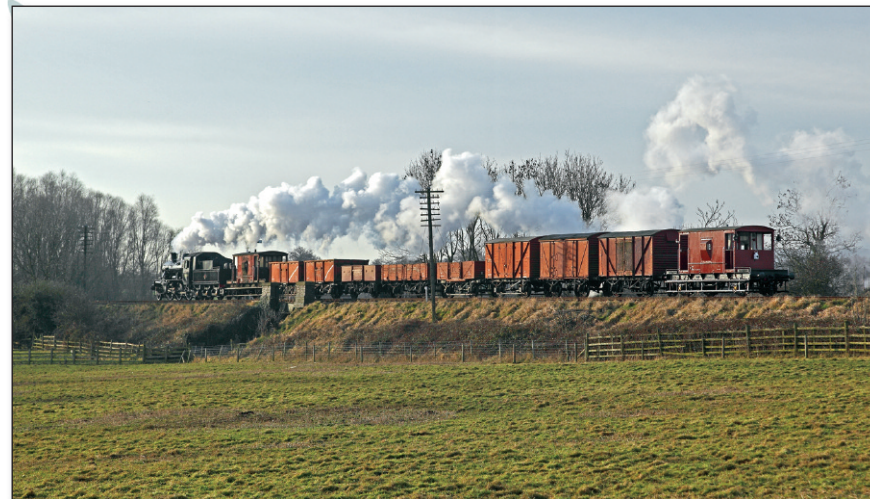
The early morning light in this location can be lovely, something photographers can exploit during special events when the train service starts earlier than usual. 78019 is heading towards Quorn and Woodhouse with short mixed freight.