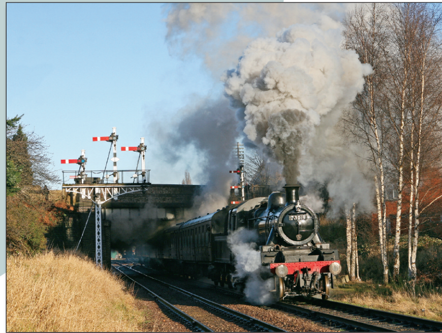
The signals at Beeches Road provide photographers with a real treat, creating lots of added interest. 78019 is making a rather spirited departure on a cold winter's day.