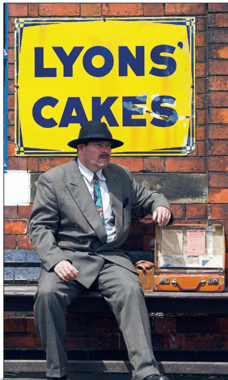
You never know who you'll meet at Quorn and Woodhouse during a 'War on the Line' event!