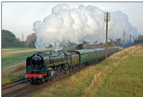
Woodthorpe is one of the most popular locations along the line for photographers. 'Oliver Cromwell' heads a mixed train of green and red/cream coaches.