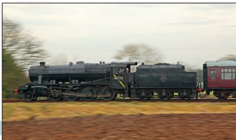
Caught at speed. 48773 (actually 48305) is approaching Woodthorpe.